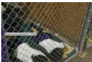
A glimpse of immigrant children at hold ity entral.com